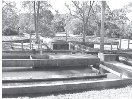
The sedimentation tank at the South Kempsey Sewerage Treatment Works