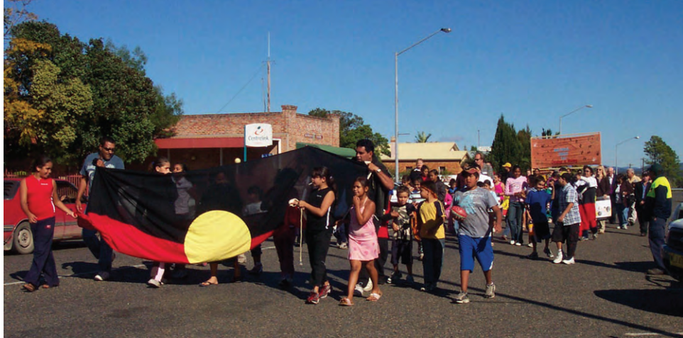
ABOVE: Great weather and wonderful community spirit made this year's NAIDOC week march and flag raising ceremony a huge success.

Kempsey Shire Council's Aboriginal Liaison Committee, The Kempsey Aboriginal Lands Council, and Coffs Harbour's Indigenous Co-ordination Centre sponsored the week's activities.