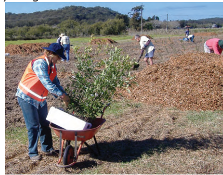
ABOVE: Volunteers hard at work at the Boyter's Lane tree planting in early August.

The community spirit shown by those who participated was just amazing. It will be wonderful to see the results of this effort in a few years time when the saplings become strong young trees.