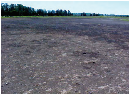
Before revegetation: Clybucca Southern Scald in 2004

The revegetation of acid sulfate soil scalds is an important component in reducing acid water discharge into our waterways, which will help preserve marine ecosystems and fisheries.