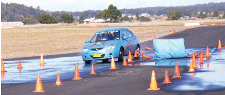
ABOVE: One of the participants in the safe driving course, held at Kempsey Airport in mid August, learns how to control a skid.

This project is a wonderful example of what can be achieved when a community identifies a specific need in its midst.