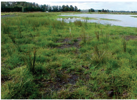
After revegetation: Clybucca Southern Scald in 2005