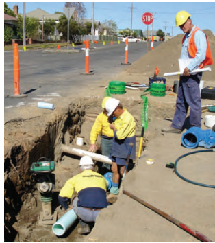
ABOVE: Work continues on the upgrading of the mains in Tozer Street, West Kempsey

From a financial point of view it is also important to realize that under the Local Government Act 1993, the money generated by Water charges, through the fixed access and the user pays system, must be spent in this same category. It cannot be used to subsidise other local government services. Among other things, Council uses Water rates to maintain and renew the Shire's water infrastructure, and to treat and monitor water quality.