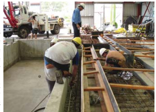
Above: Work continues on the new South West Rocks Water Treatment Plant.

Water from the local bore field will be pumped to the new plant, where it will move through a series of tanks and Zanon membrane filters to remove impurities. The water will then be pumped to the existing reservoirs near Gregory Street and distributed through the existing reticulation pipe work to the residents. When the new plant comes on line, the residents of South West Rocks will receive a better quality water supply.