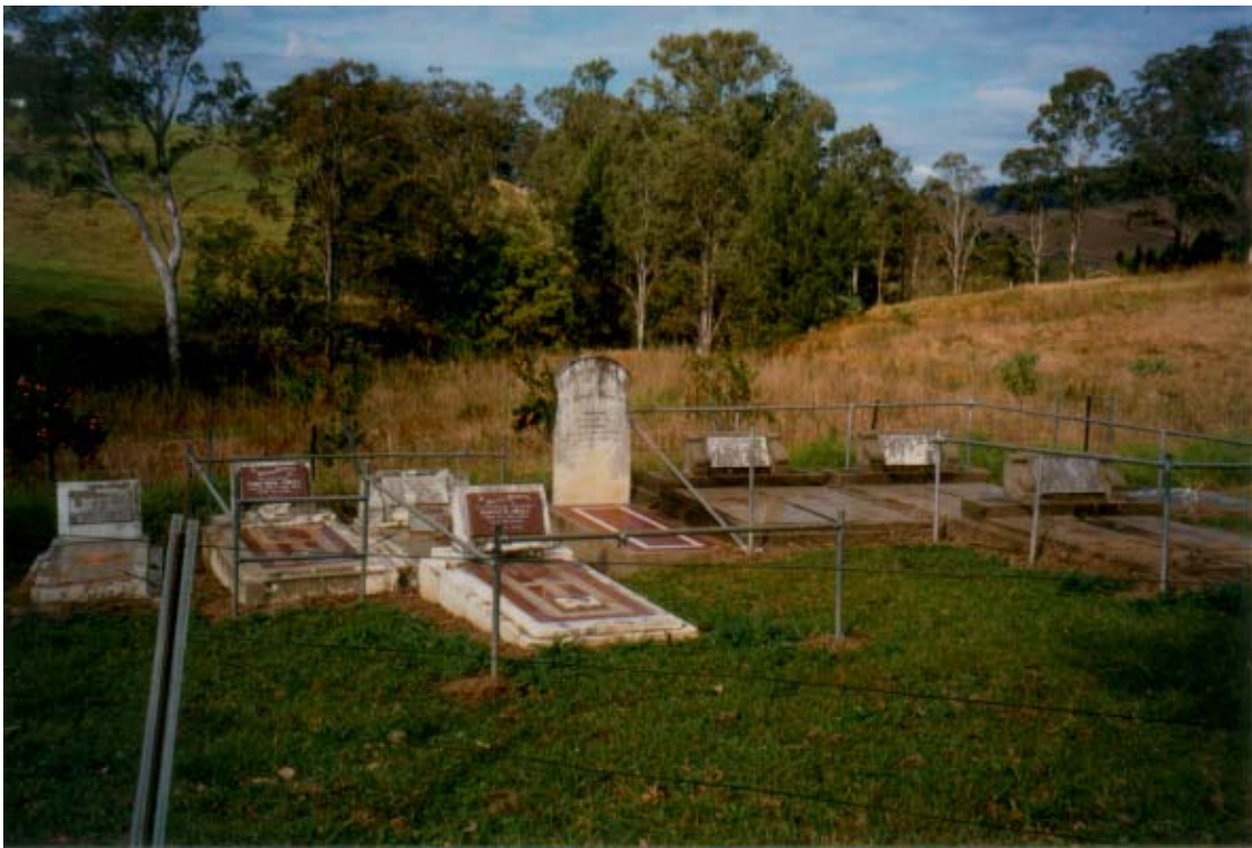
Headstone protection methods at the Cemetery.