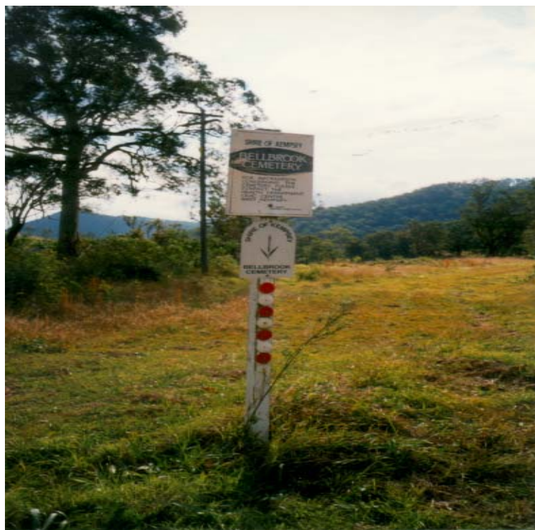
Current Cemetery signage.