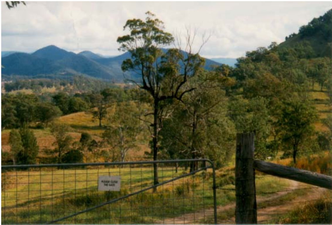
Cemetery Access Road, looking towards the cemetery.