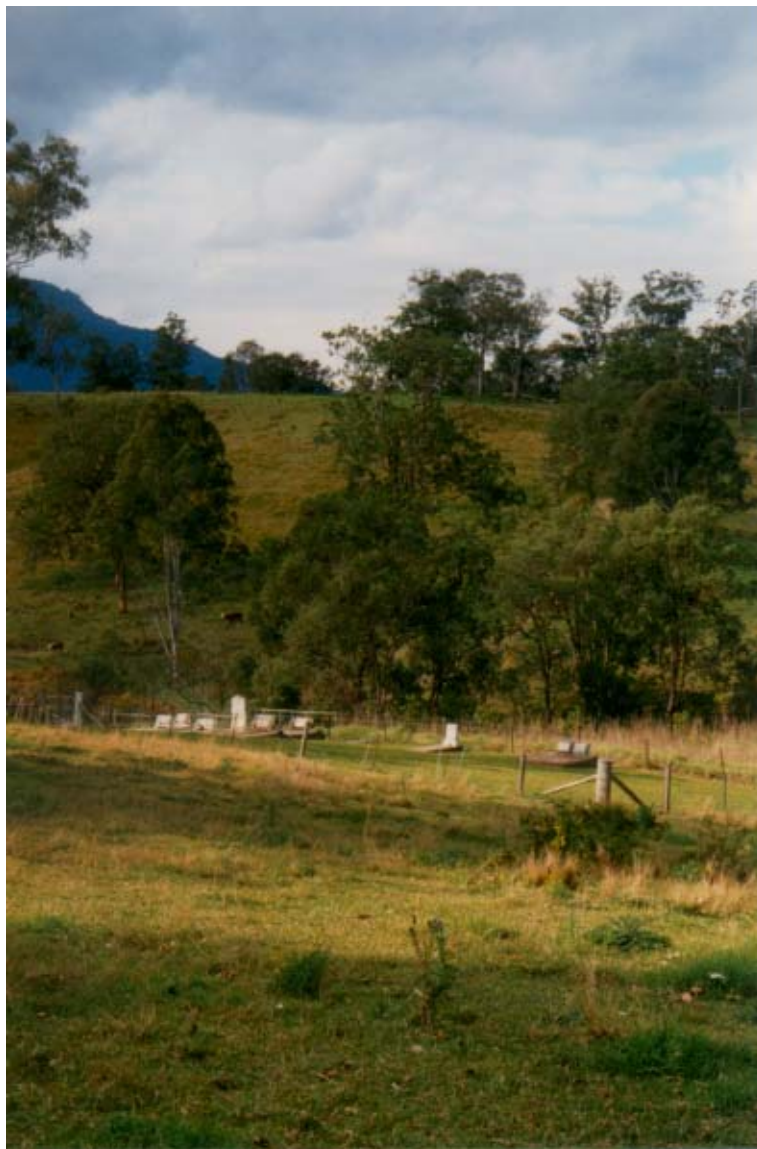
Headstones in the Catholic Portion of the Cemetery