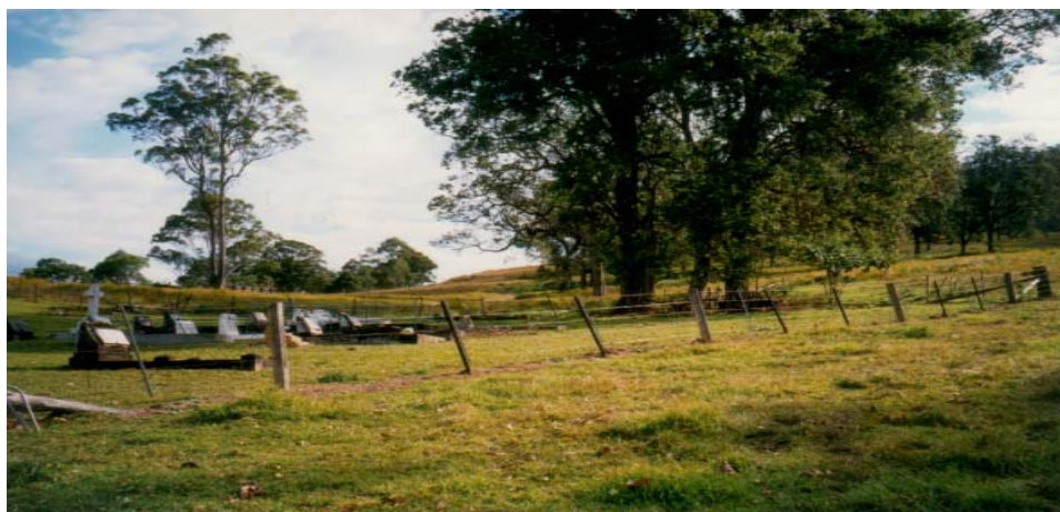
Headstones at the Anglican Portion of the Cemetery.

The Cemetery Services Asset Management Program for all cemeteries is detailed in Section 10.