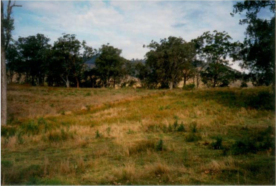
Land available for future expansion if required.