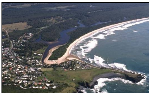
Killick Creek and Crescent Head township

Killick Creek is a small estuary on the mid north coast of NSW connected to the ocean adjacent to the township of Crescent Head.