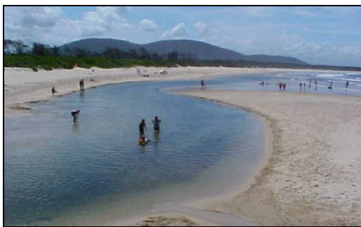
Recreational activities within Killick Creek Entrance, January 2002

Killick Creek is the principal natural waterway through the township and consequently is used by residents for a variety of recreational activities. Located immediately adjacent to the southern foreshore of Killick Creek is the Crescent Head Caravan Park. During the holiday season (early October to late April), the caravan park and other holiday accommodation within the town attracts a large number of tourists to Crescent Head, who also utilise Killick Creek, especially swimming within the entrance channel.