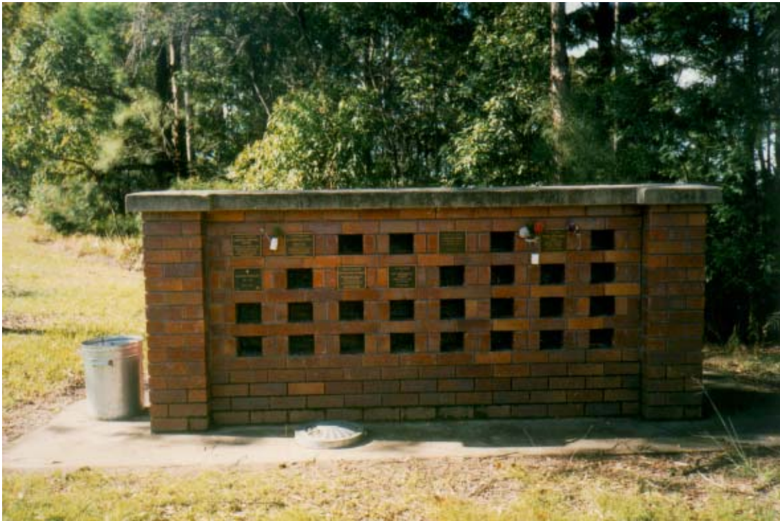
Westerly facing Columbarium Wall.