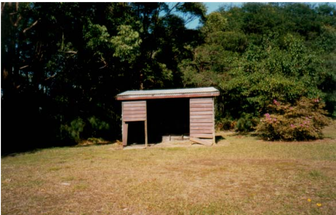
Shelter shed to be demolished and replaced.