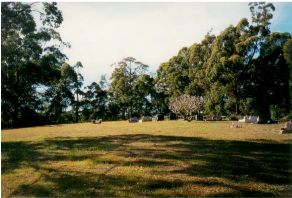
Graves facing the east.