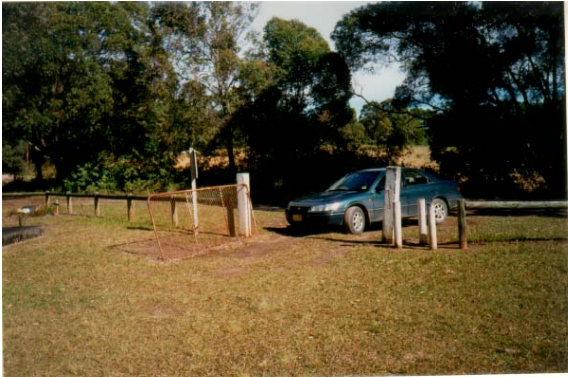
Driveway access to cemetery to be done up.