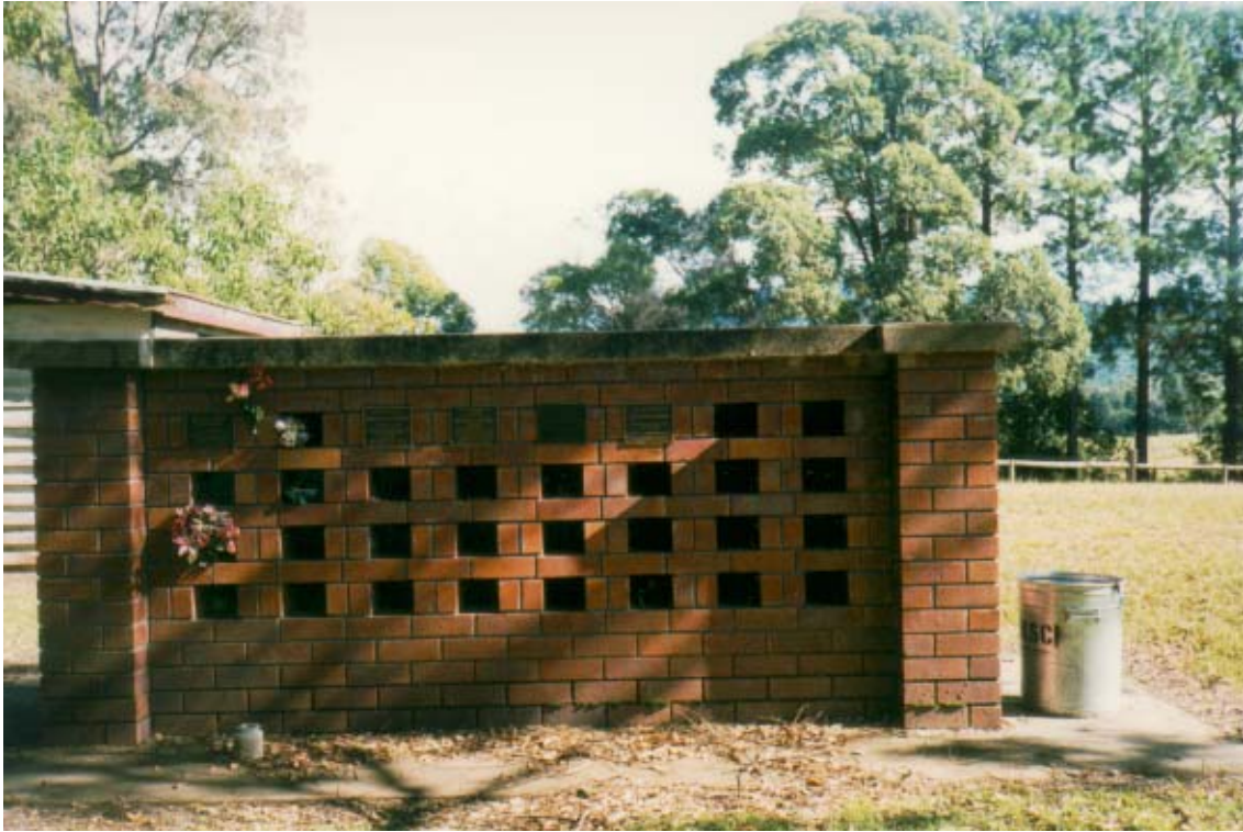
Easterly facing Columbarium Wall