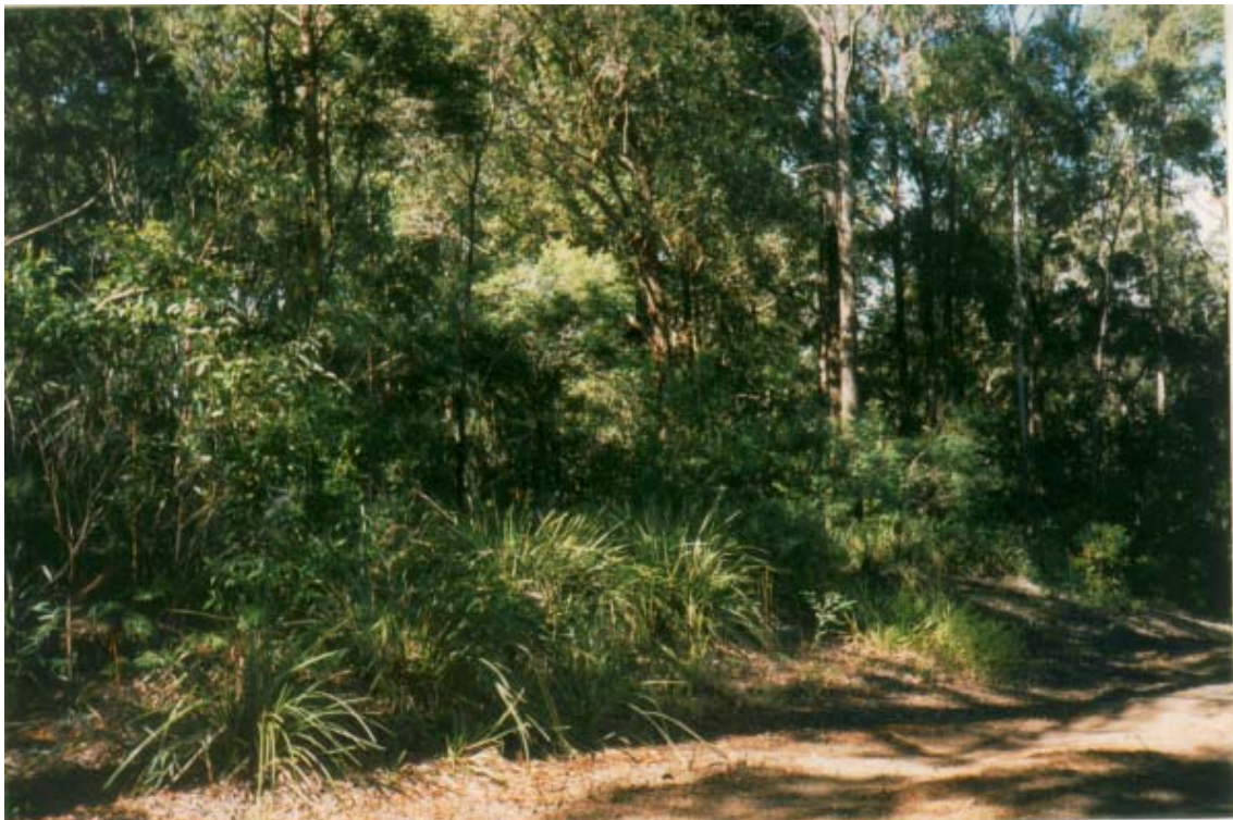
Bushland adjacent to the Cemetery.