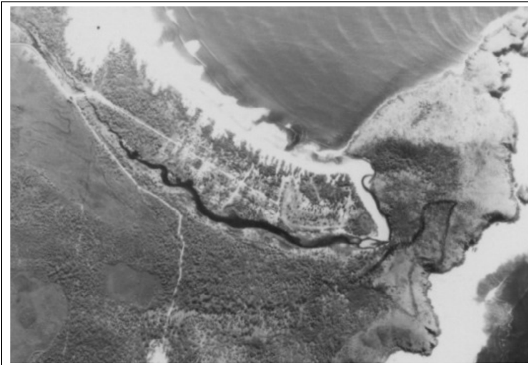
Figure 3. 1956 aerial photograph of Korogoro Creek and Hat Head village.

1956 aerial photograph show Korogoro Creek with a narrow channel opened to the sea.