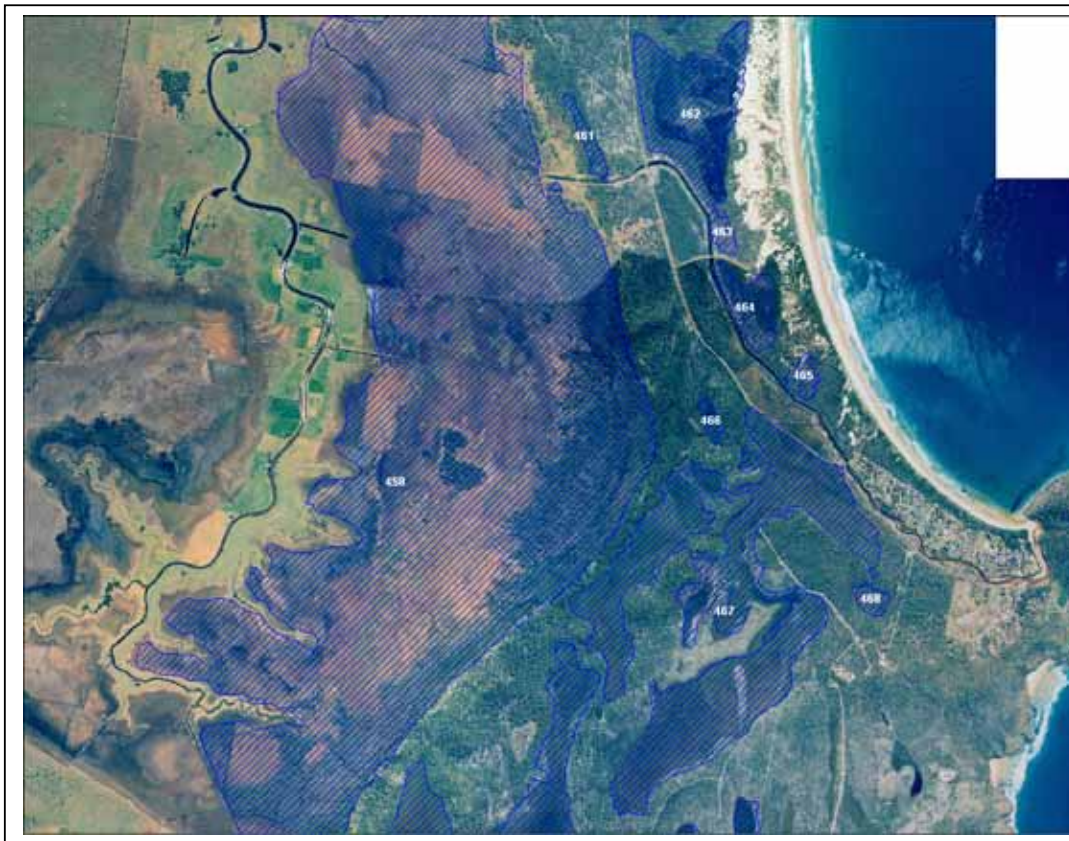
Figure 4. SEPP 14 locations in Korogoro Creek catchment.