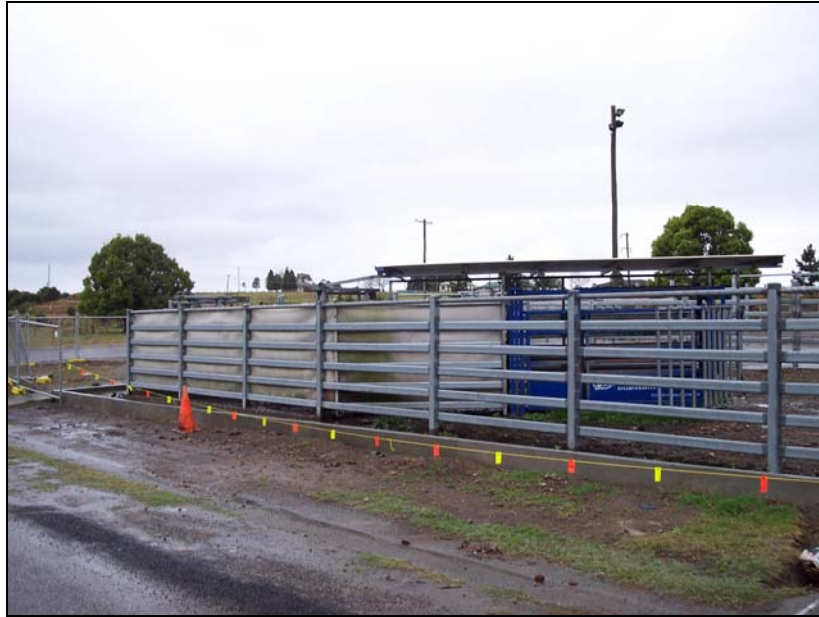
20% completed Northern pens