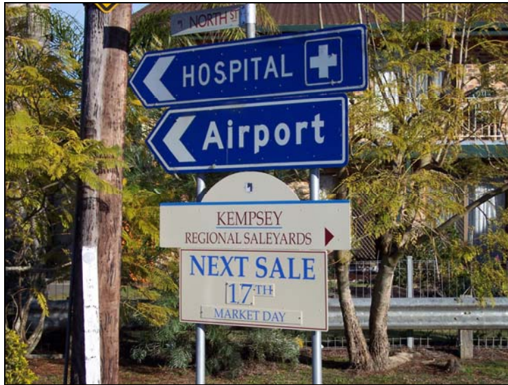
Next Sale Date Sign