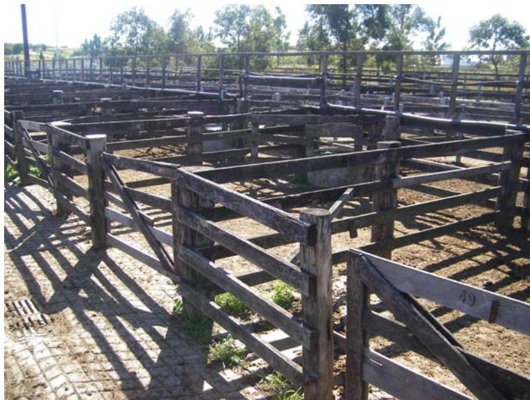
Final Portion of northern end to complete