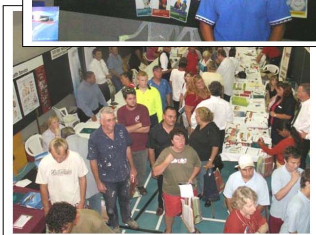
Hundreds of people visited the Centrelink Employment Expo on November 22