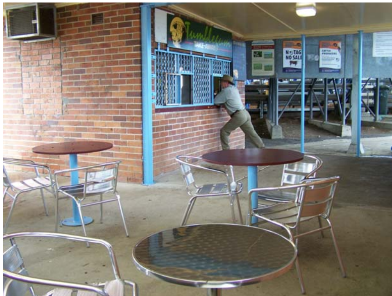
Upgraded kiosk seating

Expressions of Interest were called in October for the lease of the canteen. Tumblegum Bakehouse was awarded the contract to operate the kiosk following a call for expressions of interest. They have brought in a fresh new approach with a diverse menu, quality signage, and improved tables and chairs. Council has received plenty of positive feed back from the public on the quality of the food and service.