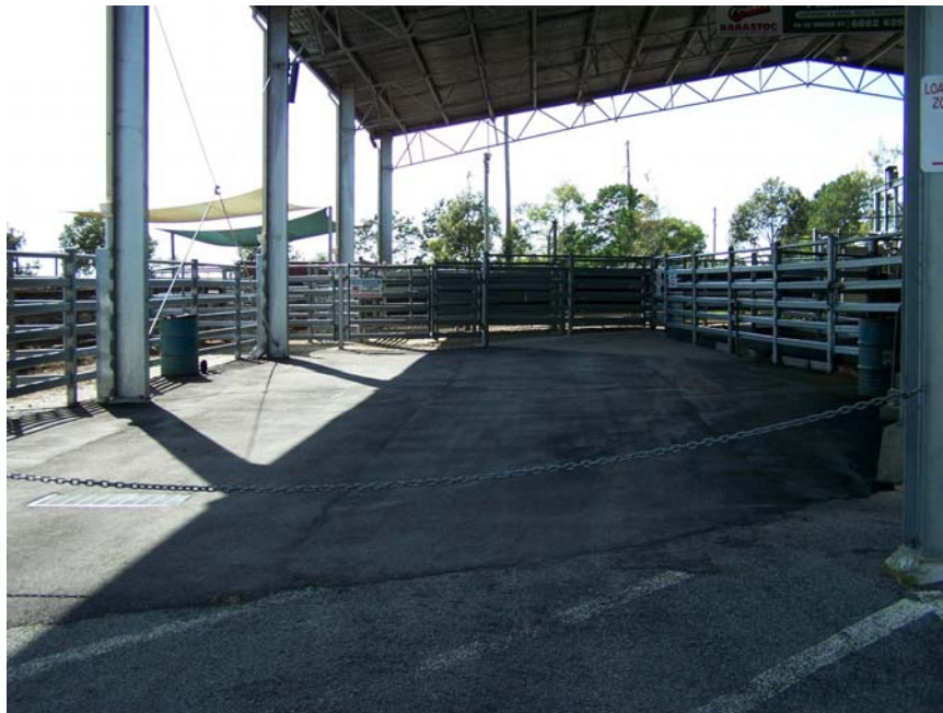
New Bitumen (Public Area)

The 2007/08 Budget includes provision for a further improvement works program of $250,000 (from Loans) which would enable completion of the reconstruction on the northern end and substantial improvement of the southern end.