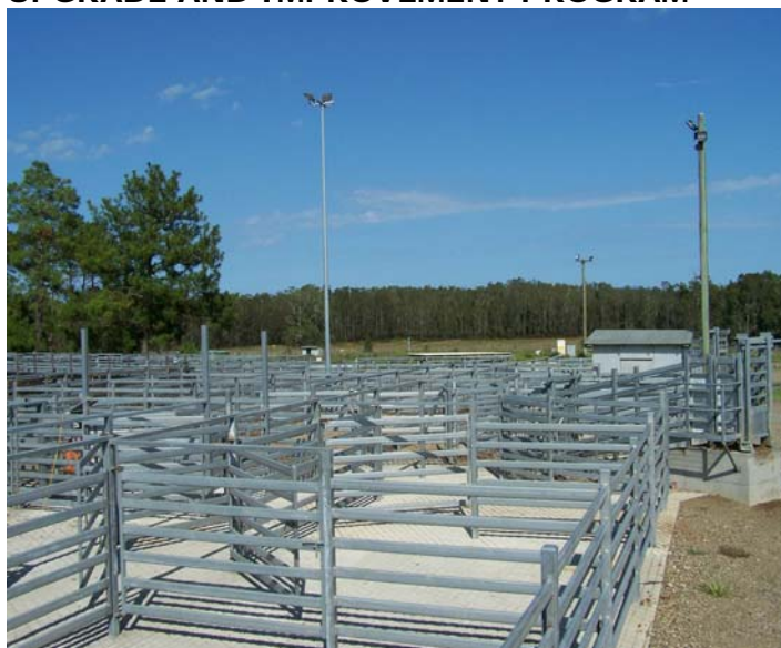
Completed Northern pens