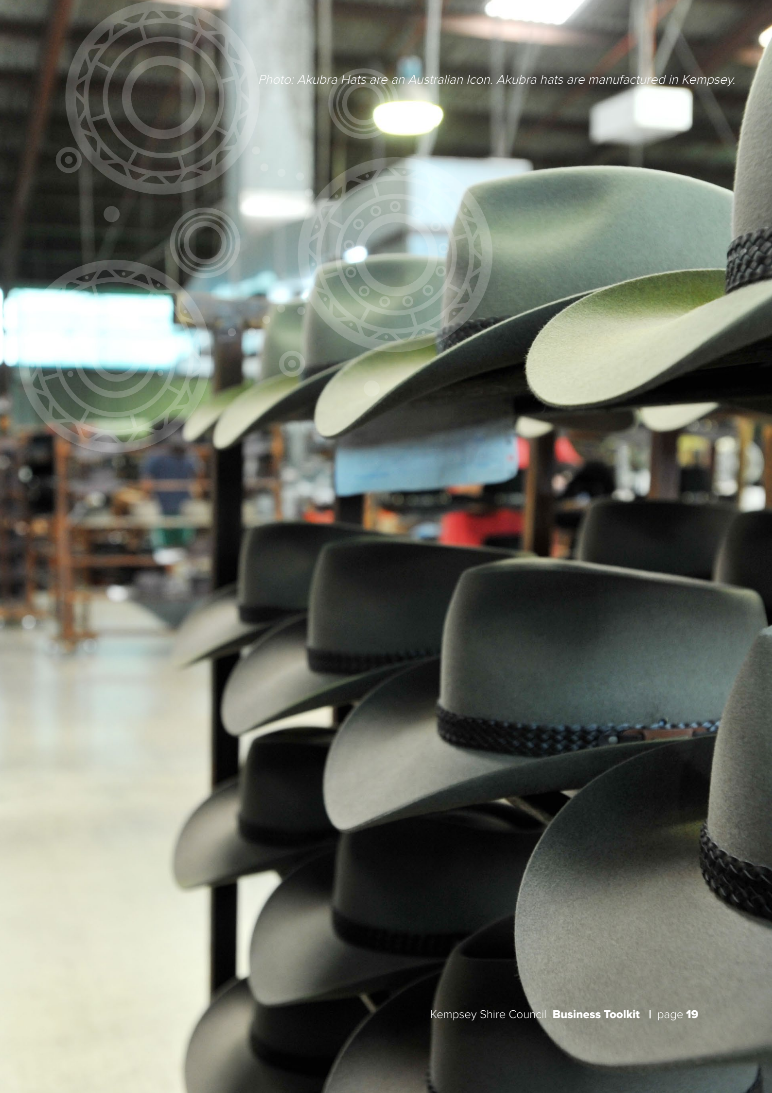
Photo: Akubra Hats are an Australian Icon. Akubra hats are manufactured in Kempsey.