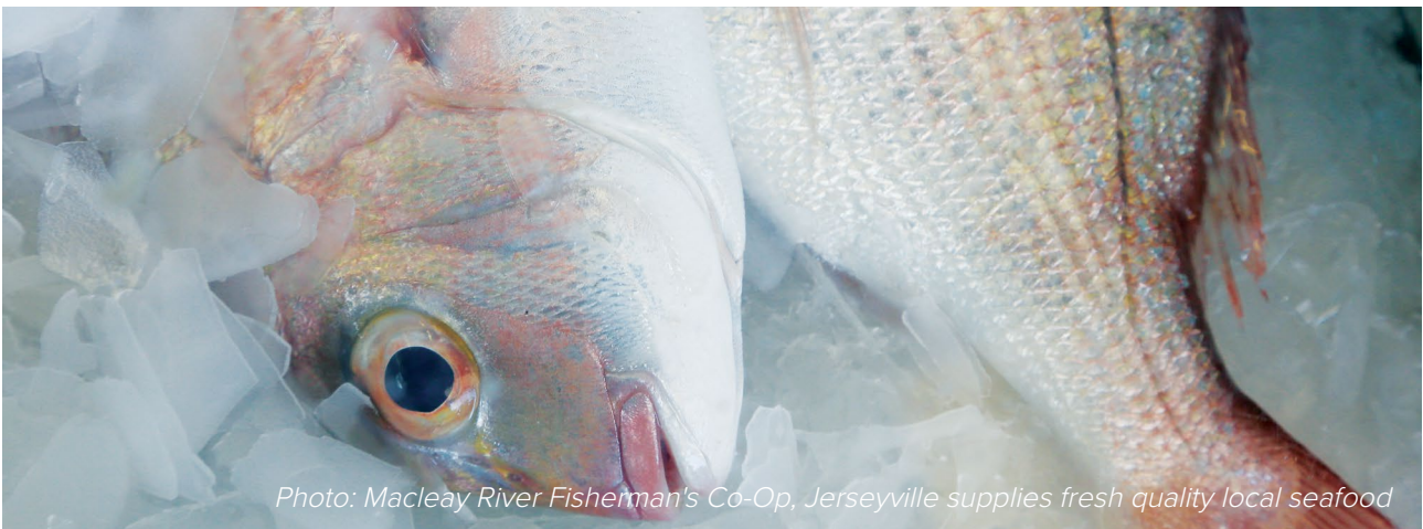
Photo: Macleay River Fisherman's Co-Op, Jerseyville supplies fresh quality local seafood

Our vision is to support smart and sustainable agribusiness in the Macleay Valley. If you're looking to expand your markets or want to learn more about agribusiness opportunities, our Economic Development Officers can connect you to a range of advice and assistance. Contact us on 02 6566 3200 or email agriculture@kempsey.nsw.gov.au