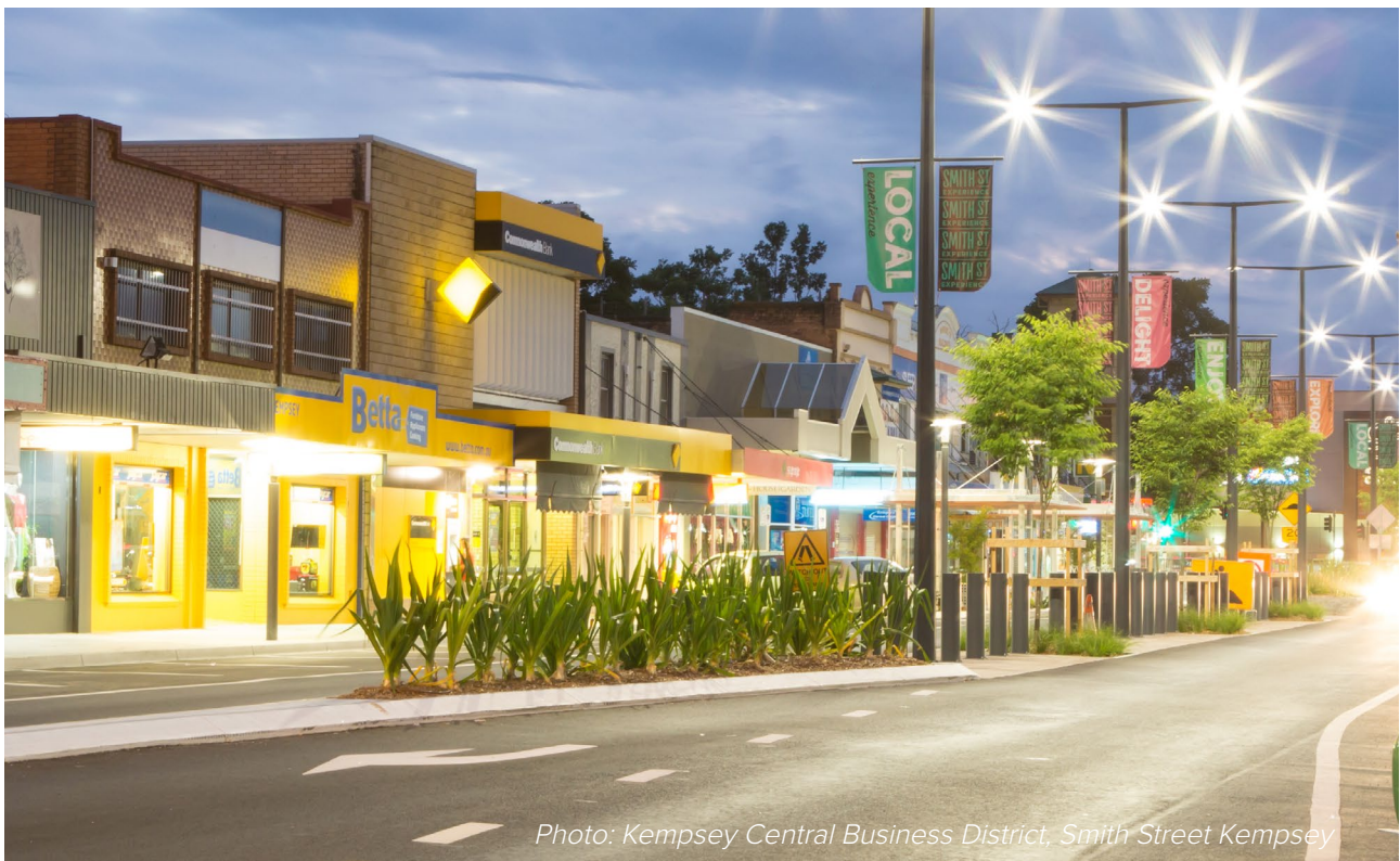
Photo: Kempsey Central Business District, Smith Street Kempsey