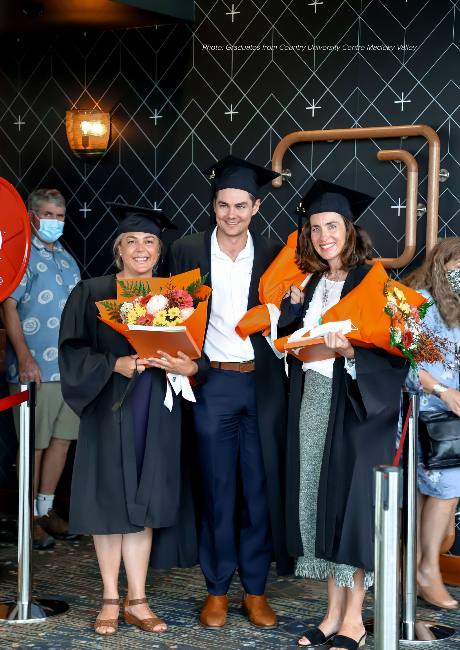
Photo: Graduates from Country University Centre Macleay Valley