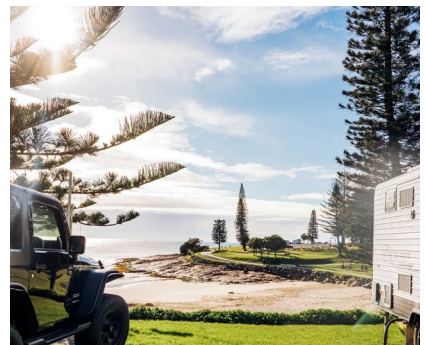
Photos: Kempsey Riverside Markets, Nestle Factory and Horseshoe Bay