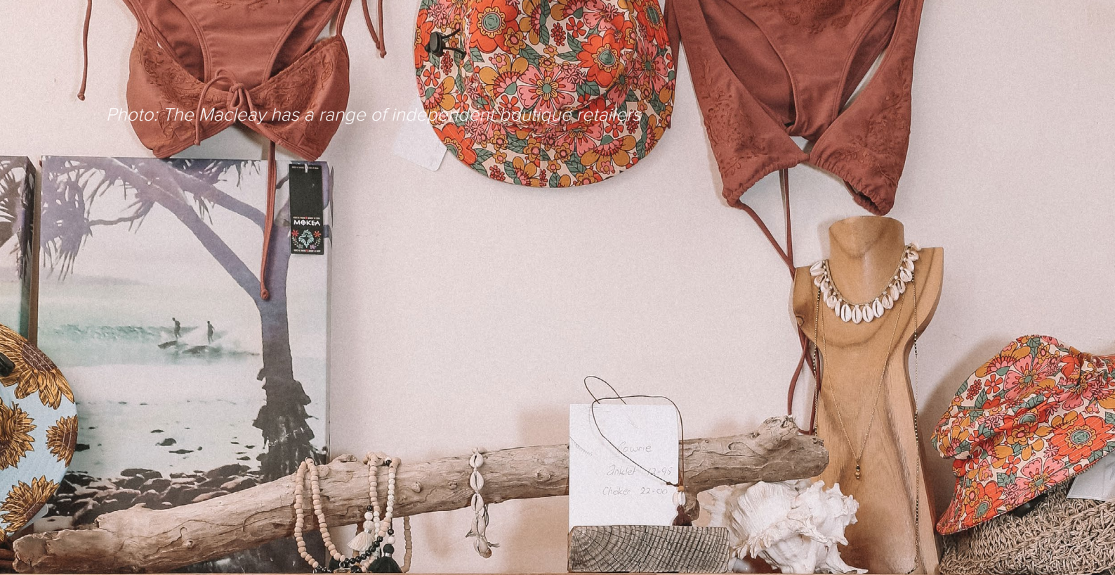
Photo: The Macleay has a range of independent boutique retailers