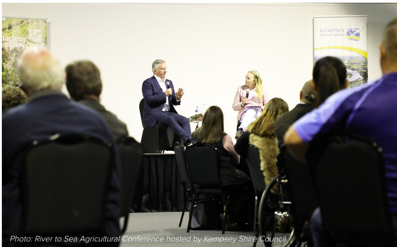
Photo: River to Sea Agricultural Conference hosted by Kempsey Shire Council