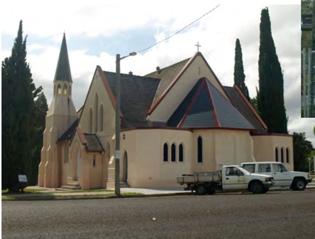
All Saints Church West Kempsey