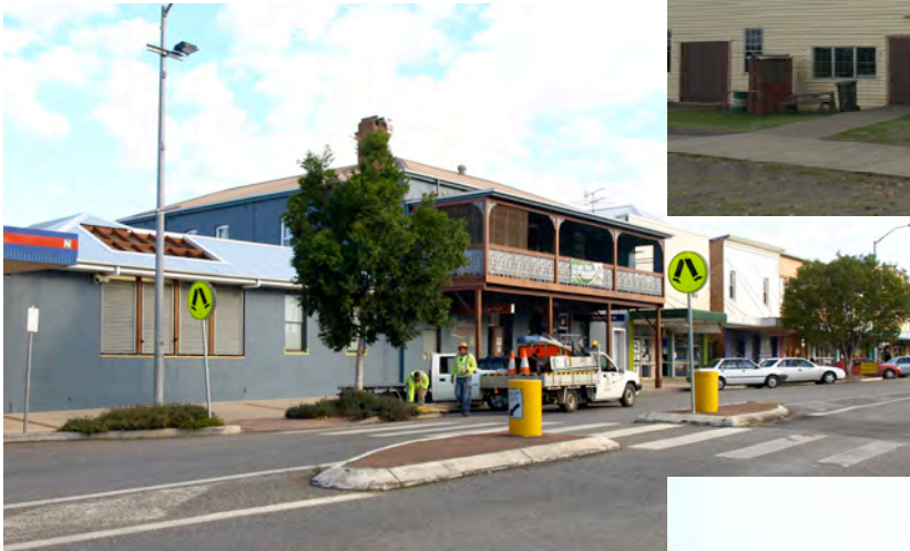
West Kempsey Hotel