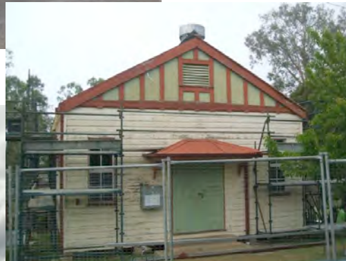
Bellbrook Community Hall